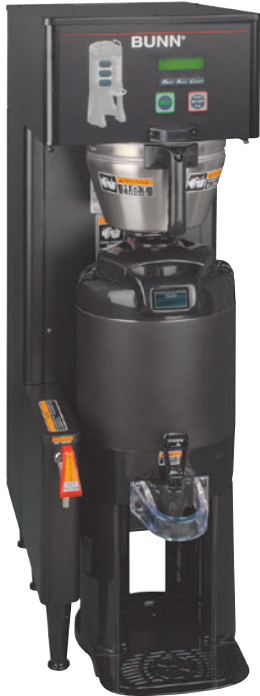
Single TF DBC with 1.5 gallon TF Servers* (servers sold separately)

Dimensions: 35.7" H x 12.1" W x 19.2" D (90.7cm H x 30.7cm W x 48.8cm D)